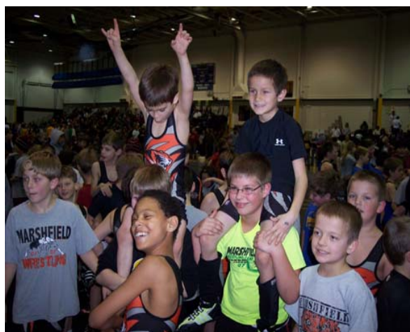
Marshfield Youth Wrestlers display pride during the Parade of Wrestlers, prior to the Start of their wrestling matches.

Make payment to MWC and Bring this portion on Enrollment Night or Mail to: PO Box 651, Marshfield WI 54449